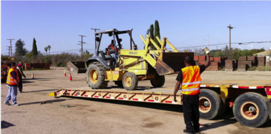
The above picture depicts one student guiding another during their Load & Tie Down Training, while the instructor observes. The Load & Tie Down Certification is awarded to all Trucking and Heavy Equipment students.