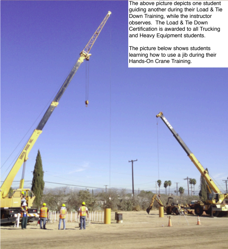
The picture below shows students learning how to use a jib during their Hands-On Crane Training.